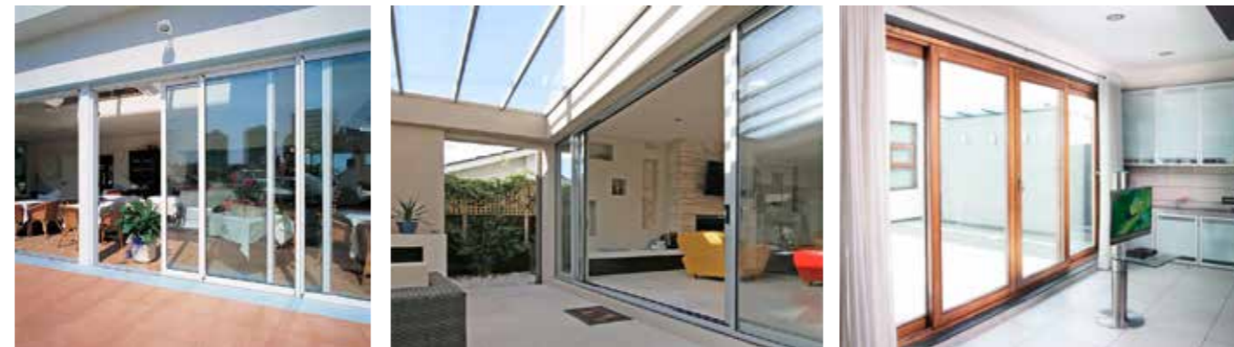
Flame-proof glass sliding door