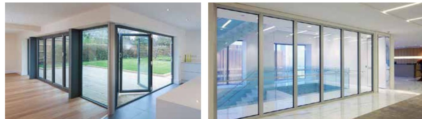
Inox door with flame-proof glass